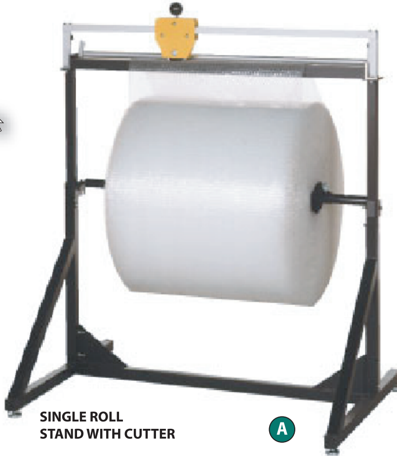
SINGLE ROLL STAND WITH CUTTER