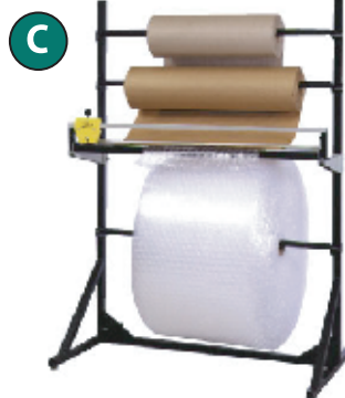
MULTIPLE ROLL STAND