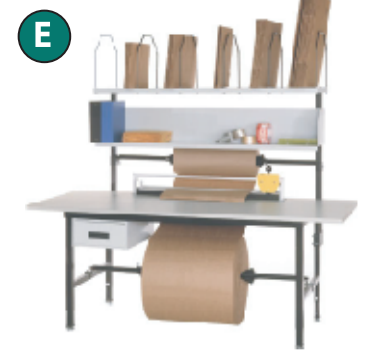
PBS-911 FULL FUNCTION BENCH

... HELPS YOU DEFINE RESOLVE THESE ISSUES: